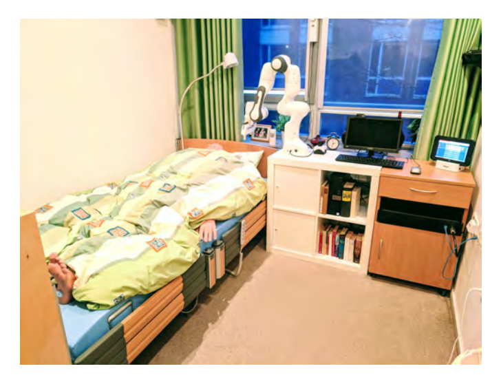
Fig. 5. View of the complete proof-of-concept setup: bed, dummy, robot arm.