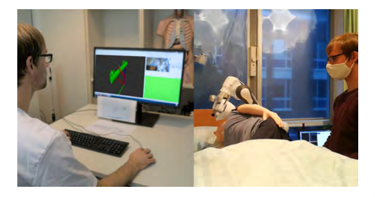
Fig. 2. The system we proposed consists of a remote nurse, who determines the position where the robot is applied to the patient, and an on-site caregiver, who now has both hands free for his work.

one direction or the other. They always stand in front of the patient.