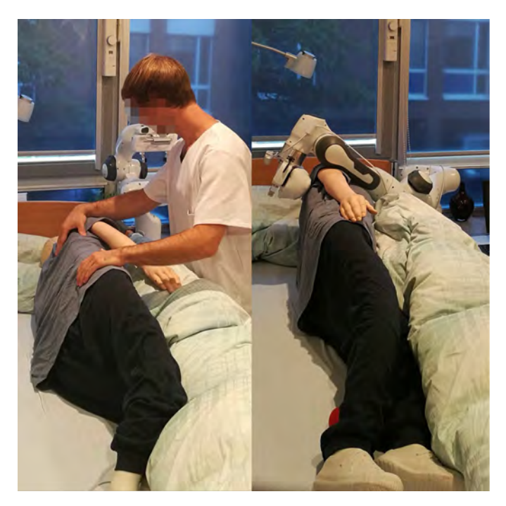
Fig. 1. Comparison between how a caregiver holds a patient and how our one-armed manipulator fulfills the same task. The nurse reaches from the front of the patient the shoulder and hip. It can also be seen here that not only the hand is used for the holding process.

<sup>†</sup>Â. Hein is with Carl von Ossietzky University of Oldenburg, Oldenburg, Germany, andreas.hein@uni-oldenburg.de