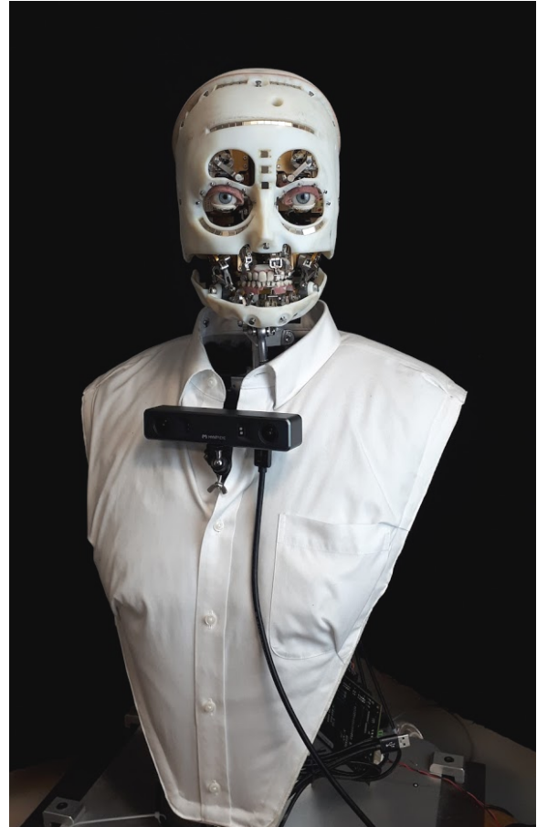
Fig. 1. Audio-Animatronics ® bust used to demonstrate the gaze system.

To produce immersive and authentic shows, animatronic systems are required to create the illusion of life . In pursuit of this goal, we focus here on a single social cue: eye gaze.