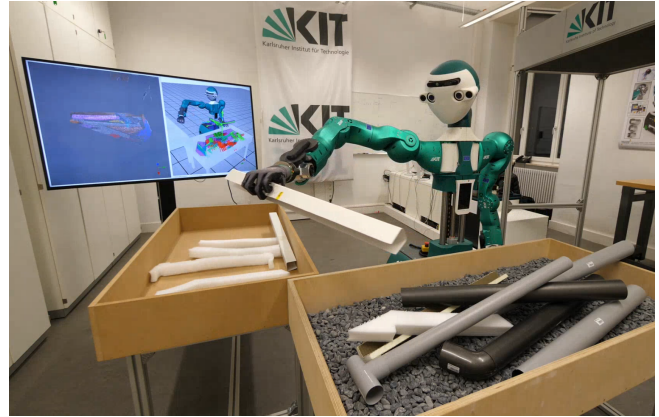
Fig. 1. The humanoid robot ARMAR-6 grasping and placing unknown objects in a cluttered scene in context of a nuclear decommissioning task.

*The first two authors contributed equally to this work